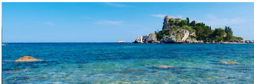
TAORMINA ISOLA BELLA